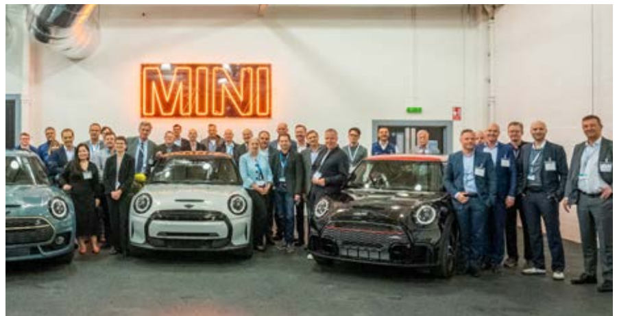
A visit to the British production facility of the MINI at BMW Oxford was also on the agenda of the Economics Minister's trip to Great Britain.

After a successful first half-year with numerous trade events and trips to countries such as the UK and Romania, our Thuringia International team is looking ahead to a packed schedule in the second half of the year. Various delegation trips, events and trade fairs will give companies guidance and momentum for their international businesses.