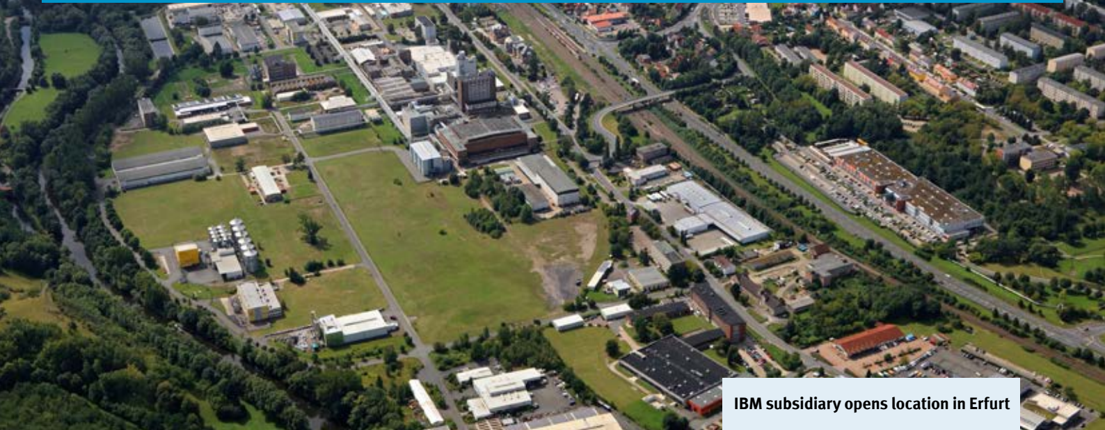
In the Rudolstadt-Schwarza industrial site, the Korean company SungEel HiTech and its partner Samsung C&T Deutschland GmbH will in future strengthen the Thuringian battery cluster with a state-of-the-art recycling plant.