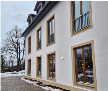
From old to new: Hotel Hohe Sonne shines in a new look.

A second construction phase is already planned: additional rooms, an event space, and a wellness area will be built on the site of the former hunting lodge.