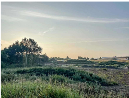
View during construction work on the core site.

The move is part of a strategic realign- Spanning approximately 15 hectares in the green spaces named “Augarten”, “Tüf- fers Garten”, and “Lunapark”, the show is