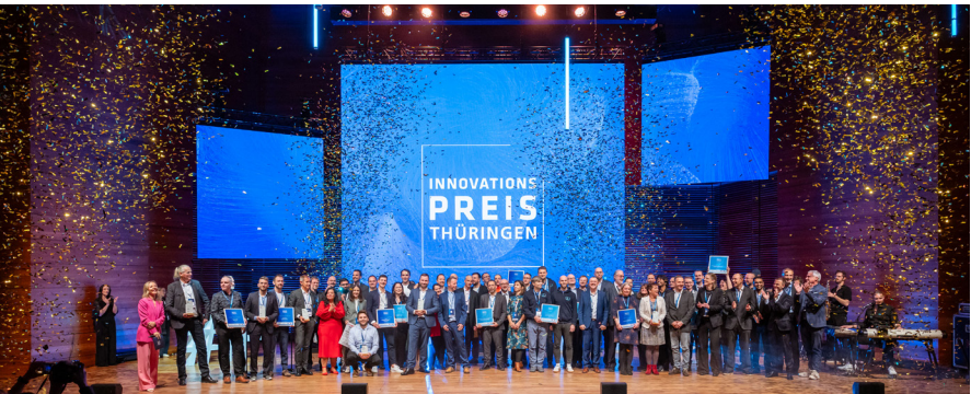
The happy winners.