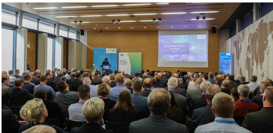
The Thuringia Supplier and Information Forum Defense sparked tremendous interest.