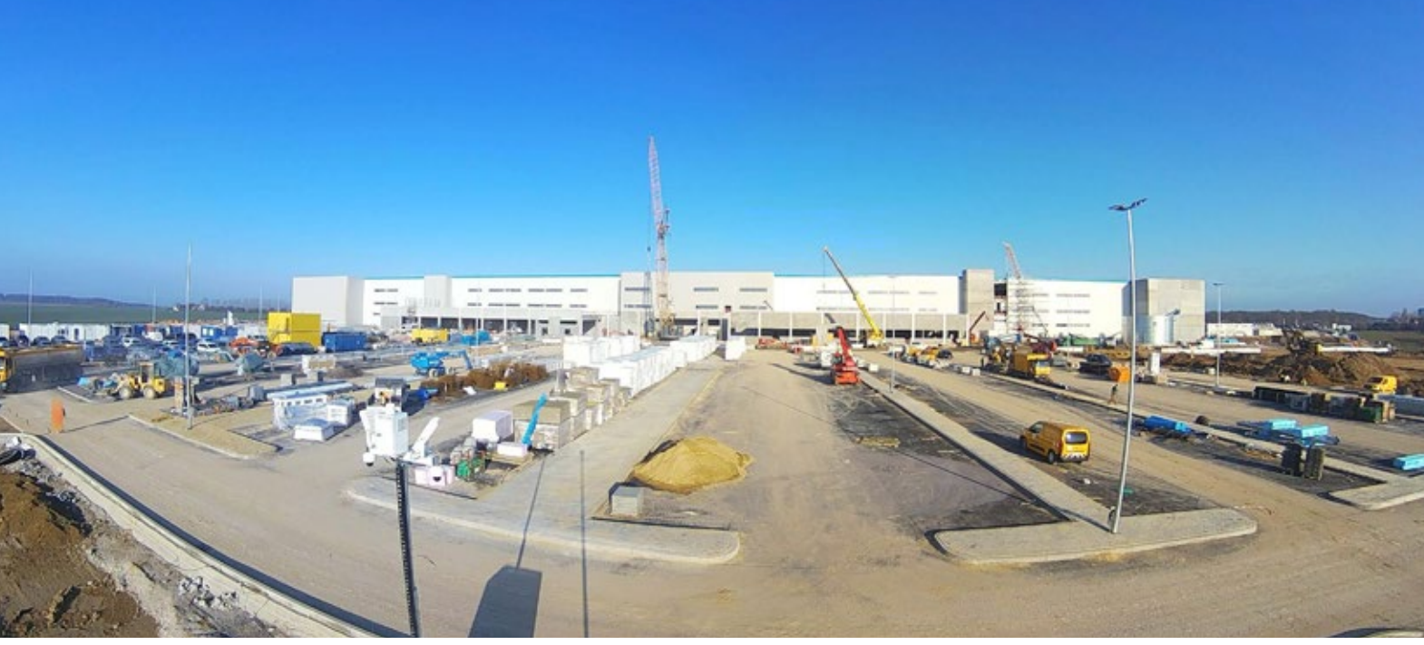
Rapid progress on the construction site of the Amazon logistics center.