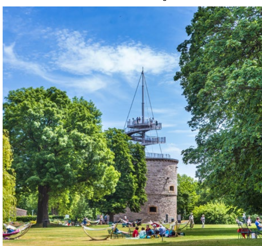
View to the observation tower in the egapark.