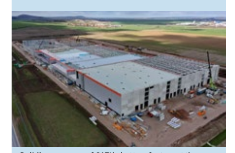
Building progress of CATL's battery factory at the industrial site "Erfurter Kreuz".

The building structure is taking shape at the large construction site belonging to Contemporary Amperex Technology Thuringia (CATT) in the Erfurter Kreuz industrial park. The Chinese battery manufacturer plans to invest EUR 1.8 billion and employ around 2,000 people at the 24-ha site. The company has irons in the fire elsewhere in Thuringia, too. CATT recently rented a bankrupt online retailer's warehouse that has stood vacant since 2019. Located in the Erfurt Freight Hub (GVZ Erfurt), the 3-ha facility will become the central European warehouse for the battery factory at Erfurter Kreuz. The project is expected to create several hundred jobs. Using an existing warehouse, which was originally constructed for EUR 45 million, will be faster than building a new facility from scratch. The batteries manufactured in Erfurter Kreuz will be shipped from the warehouse to automobile factories all over Europe. (maa)