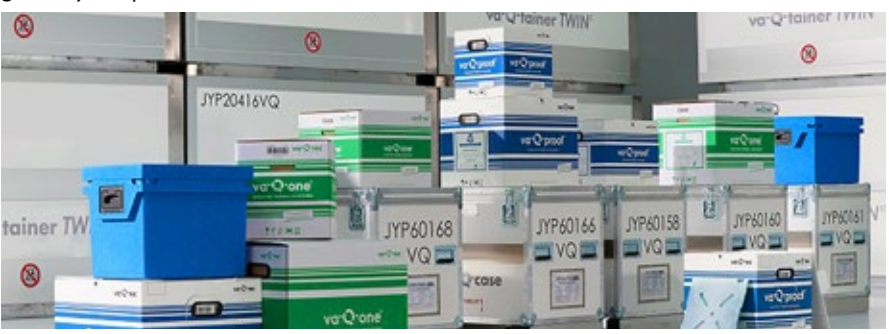
The thermal containers from va-Q-tec from Kölleda/Thuringia.

Corona vaccines arrive at the respective site in good condition, a seamless cold chain is essential. The thermo containers from va-Q-tec – produced in Thuringia – ensure any desired transport temperature between -80 °C and +25 °C thanks to the very thin insulation with vacuum insulation panels and high-tech temperature accumulators; for example, the sensitive transport of vaccine doses from Biontech and Pfizer requires temperatures as low as -80 °C – no problem for the containers from Kölleda. (gro)