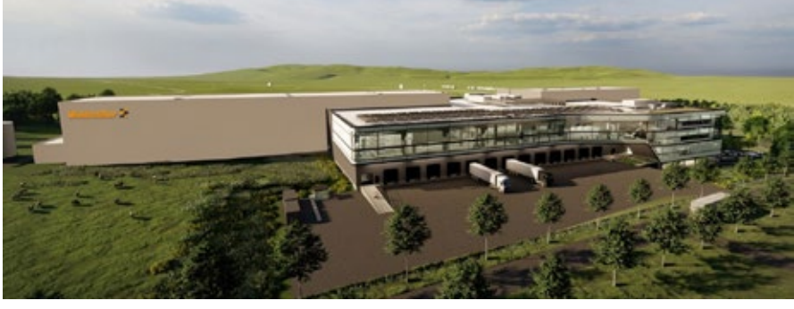
Visualization of the logistics center in the industrial area "Kindel" in Hörselberg-Hainich.

is only ten kilometers from Weidmüller's Thuringian production facility and boasts excellent access to the A4 highway and the Frankfurt and Leipzig cargo airports. Weidmüller operates other factories in Germany, Romania and the Czech Republic and intends for all the products made at these sites to be handled at the new central warehouse. The company decided to make the investment in order to keep up with fastmoving markets and optimize its supply chains. (hw)